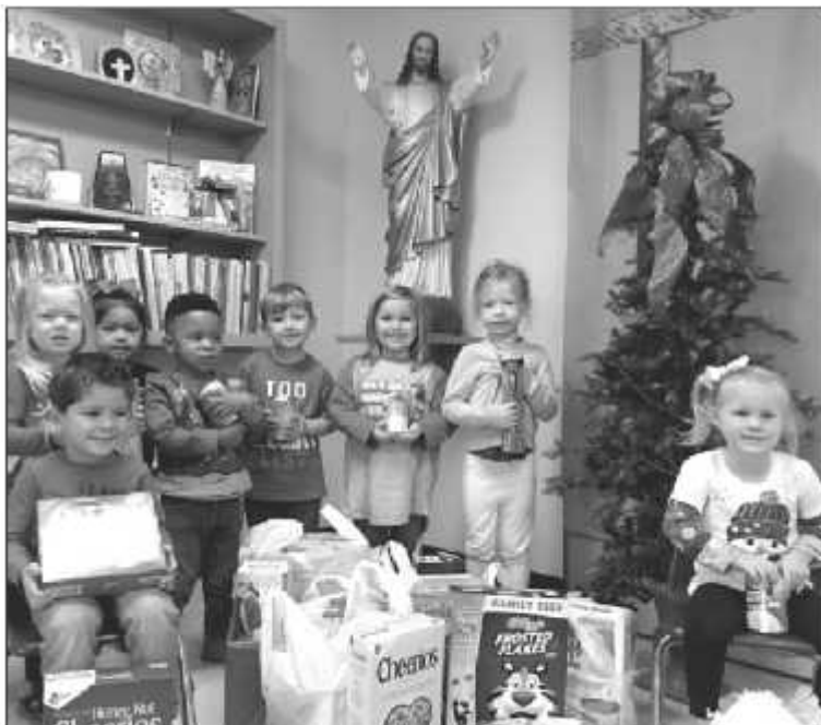
The children at Mt. Calvary Lutheran Pre-school in La Grange made a donation to the AMEN Food Pantry over the Christmas holidays.

Be reminded of what Christ has done for you in His incarnation, suffering, and death. For this will strengthen your faith and knowledge. And where that excels, so will the grace of giving excel also.