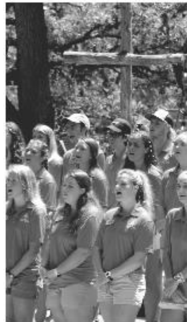
Camp Lone Star's 2023 Summer Staff will sing during offering at the morning service.

Shuttle service is provided between the parking lot and the activity area.